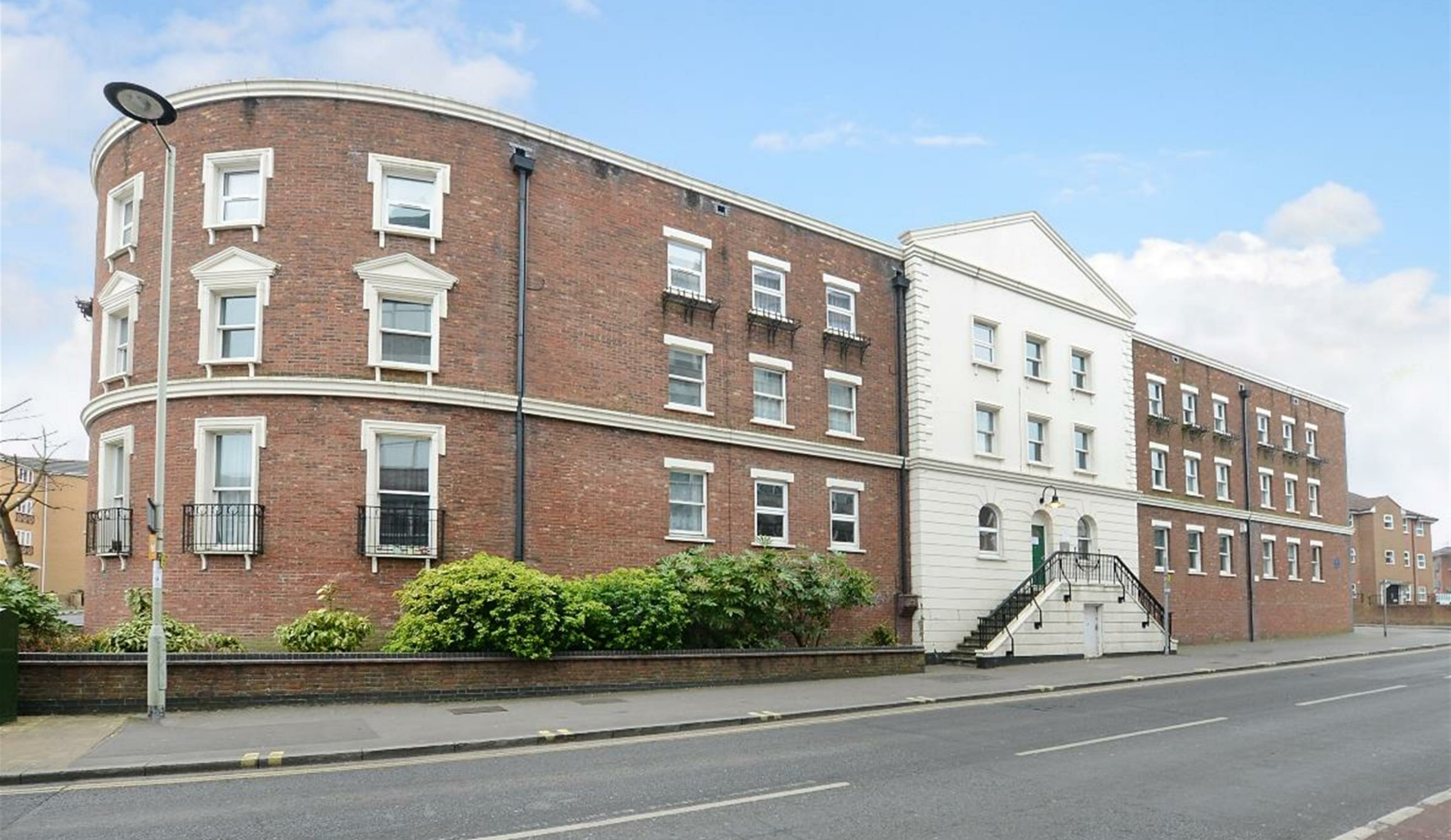
Stratfield House, Birchett Road